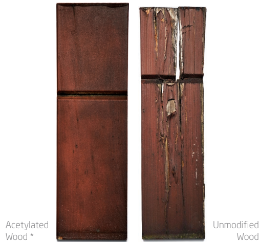
Opaque WB Acrylic Coating